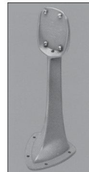
M16377/16-001 Pedestal Assembly NSN 6230-00-336-5876

Net Weight: 2 lbs. 7 oz. maximum. Approximate shipping weight for package of ten: 42 lbs