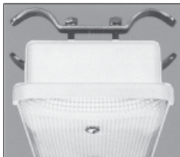
M16377/7-78.2 Rail Mount, Clear and White Prismatic Window